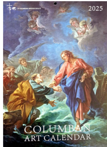
$13.00—Please get from the Parish Office