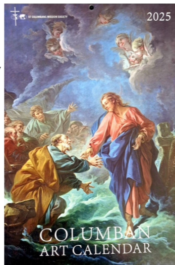
$13.00—Please get from the Parish Office

Divine Mercy Devotion & Mass on Friday 4th October 7:00pm at St Mary's Parish, 20 Kiteui Ave, Mt Albert. Exposition of the Blessed Sacrament, Chaplet of Mercy Sung, Benediction, Mass, followed by veneration of St Faustina's relic. All Welcome.