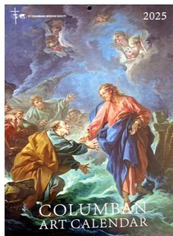
$13.00—Please get from the Parish Office

Te Kupenga Catholic Theological College is accepting enrolments for first semester 2025 from 23rd September to 22nd November 2024. Courses offered are Bachelor of Divinity, Graduate Diploma in Theology, Diploma and Certificate in Christian Studies, and a new microcredential on Managing Church Organisations.