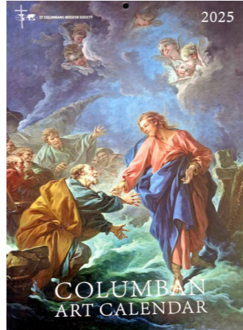
$13.00—Please get from the Parish Office

Te Kupenga Catholic Theological College is accepting enrolments for first semester 2025 from 23rd September to 22nd November 2024. Courses offered are Bachelor of Divinity, Graduate Diploma in Theology, Diploma and Certificate in Christian Studies, and a new microcredential on Managing Church Organisations.